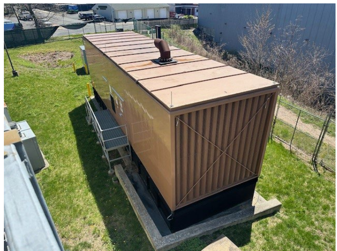
Cogent Springfield – 400 Taylor Street