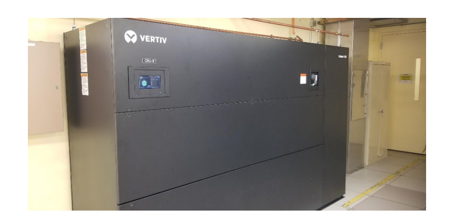
Cogent Orlando – 17401 Wewahootee Road