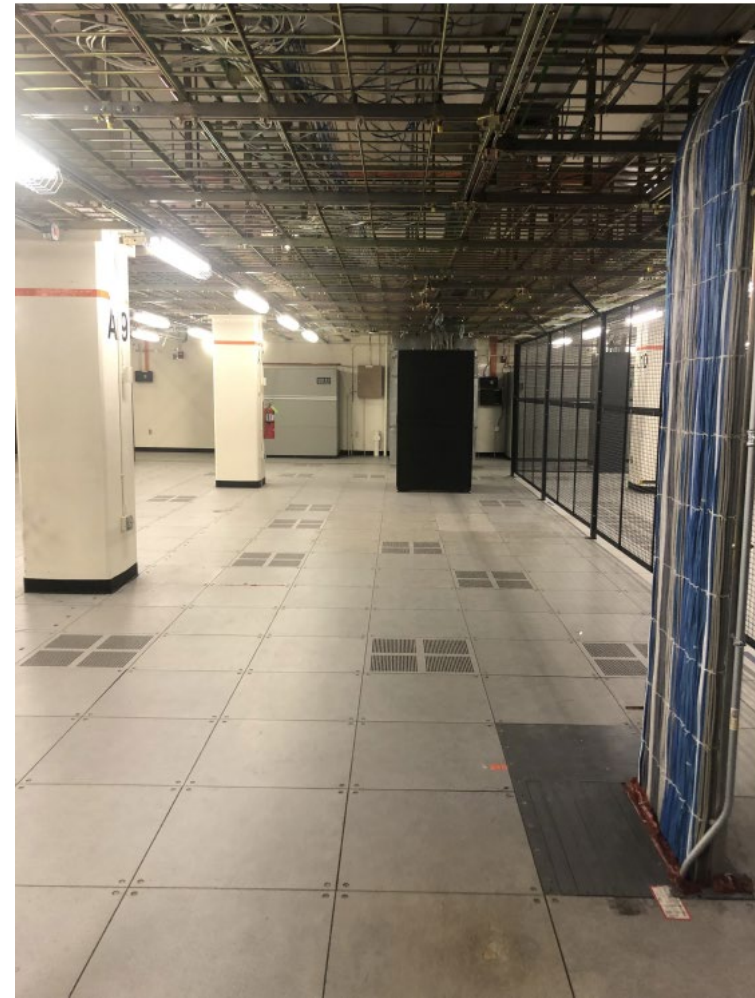
Cogent Fort Worth – 1400 E Presidio Street