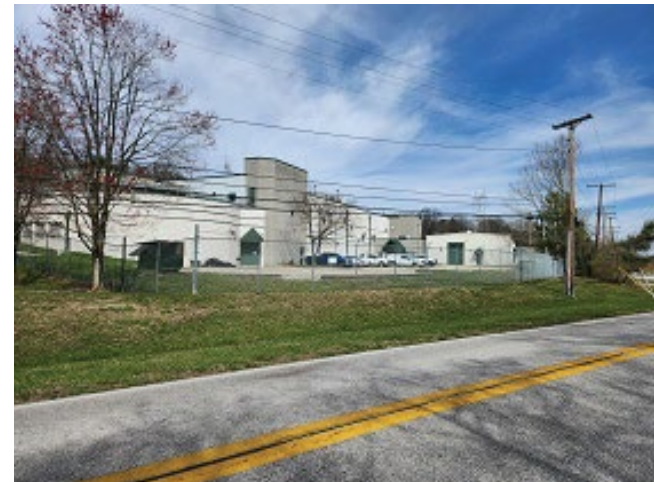
Cogent Elkridge - 6050 Race Road