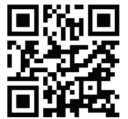
All Wave Nodes

In over 900 leading Carrier Neutral Data Centers in the United States, Canada, and Mexico. See full list of locations →